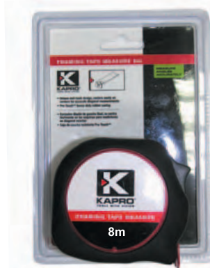
packaging dimensions : 18 x 13cm

Kapro, the Kapro logo, and Pro Touch are trademarks and/or registered trademarks of Kapro Industries Ltd.